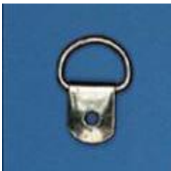
(An example of a D-ring, facing upwards)