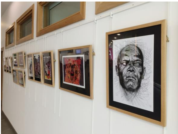
Henbury School GCSE artwork