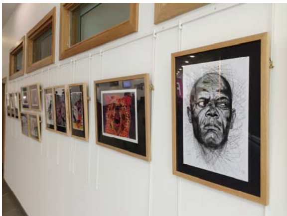
Henbury School GCSE artwork