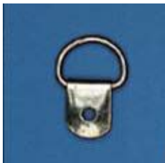
(An example of a D-ring, facing upwards)