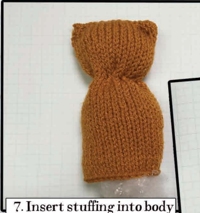
7. Insert stuffing into body