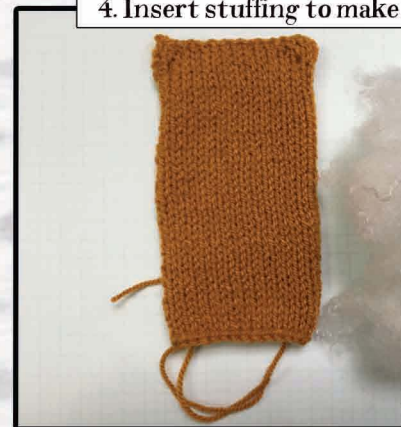
4. Insert stuffing to make head