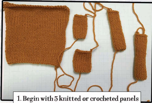
1. Begin with 5 knitted or crocheted panels