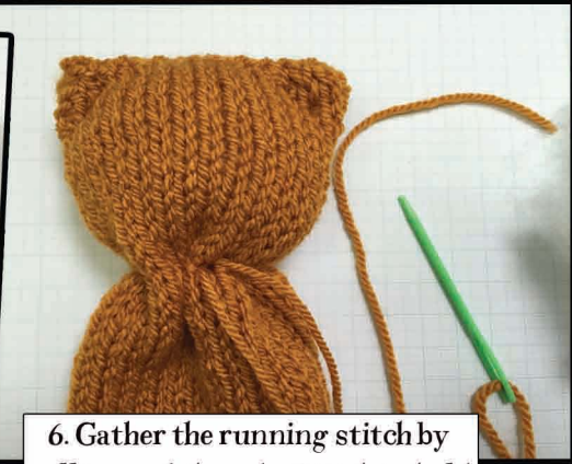
6. Gather the running stitch by pulling end threads. Stitch to hold tight and form the neck.