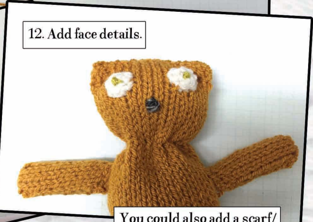
12. Add face details.