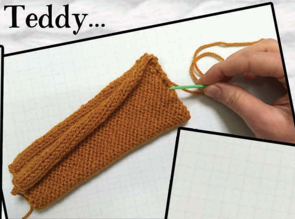
2. Fold large panel in half right side to right side. Sew up side and top. Leave bottom side open for stuffing