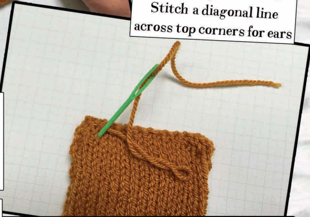
3. Turn right side out. Stitch a diagonal line across top corners for ears