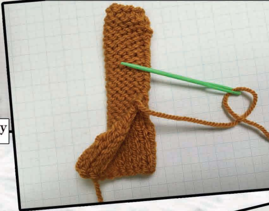
8. Stitch up the leg and arm panels, leaving one end open for stuffing if you are using it.