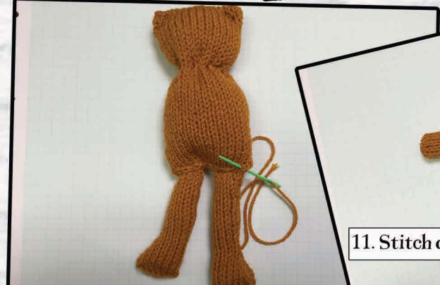
10. Tuck legs into body and stitch the bottom of the body together