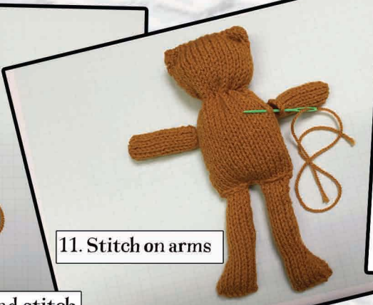
11. Stitch on arms